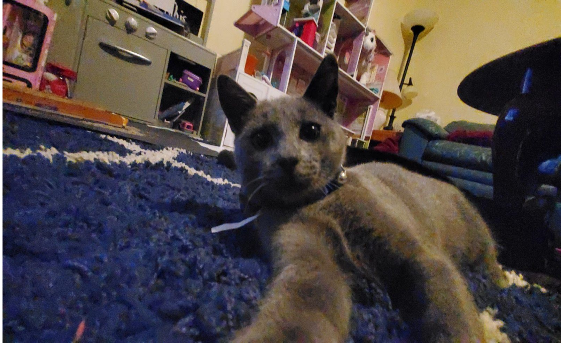
This is Hank the Kitten.